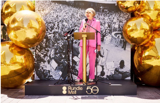
Rundle Mall 50 th Birthday Program Launch