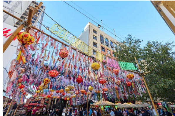
Rundle Mall Activations

Rundle Mall officially launched its 50th Anniversary (Golden Jubilee) on 12 January with a major media call featuring the Honourable Peter Malinauskas, MP, Premier of South Australia and the Right Honourable The Lord Mayor of Adelaide, Dr Jane Lomax-Smith. The event aimed to reinforce the Mall's cultural significance. Branding for the 50 th anniversary is underway with a year long program of activations planned. State government committed to providing $250k to support delivery of the September anniversary event.